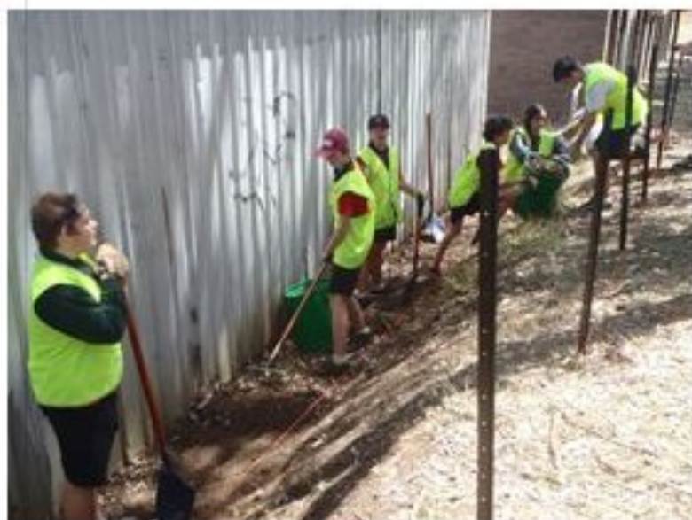
Student's clearing away debris in preparation for the retaining wall project.

Kanahooka High School has a new school sport on offer, in addition to the many varied options students have on Thursday afternoon. The group is made up of interested students of all years who are willing to extend their knowledge in the field of general construction. The first project the students have been tasked with is a twelve metre retaining wall that runs alongside a storage shed. This building was identified as a priority due to the deterioration and water damage from the ongoing debris that built up alongside its north side.