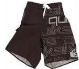
beach shorts of any kind